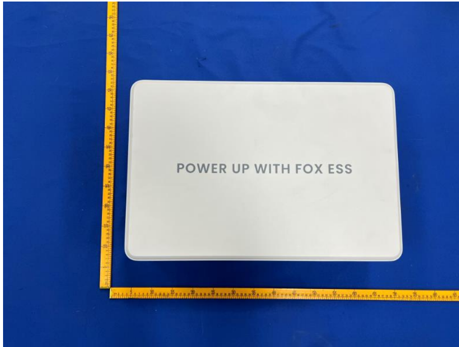
样品图片 (Sample photograph) -2