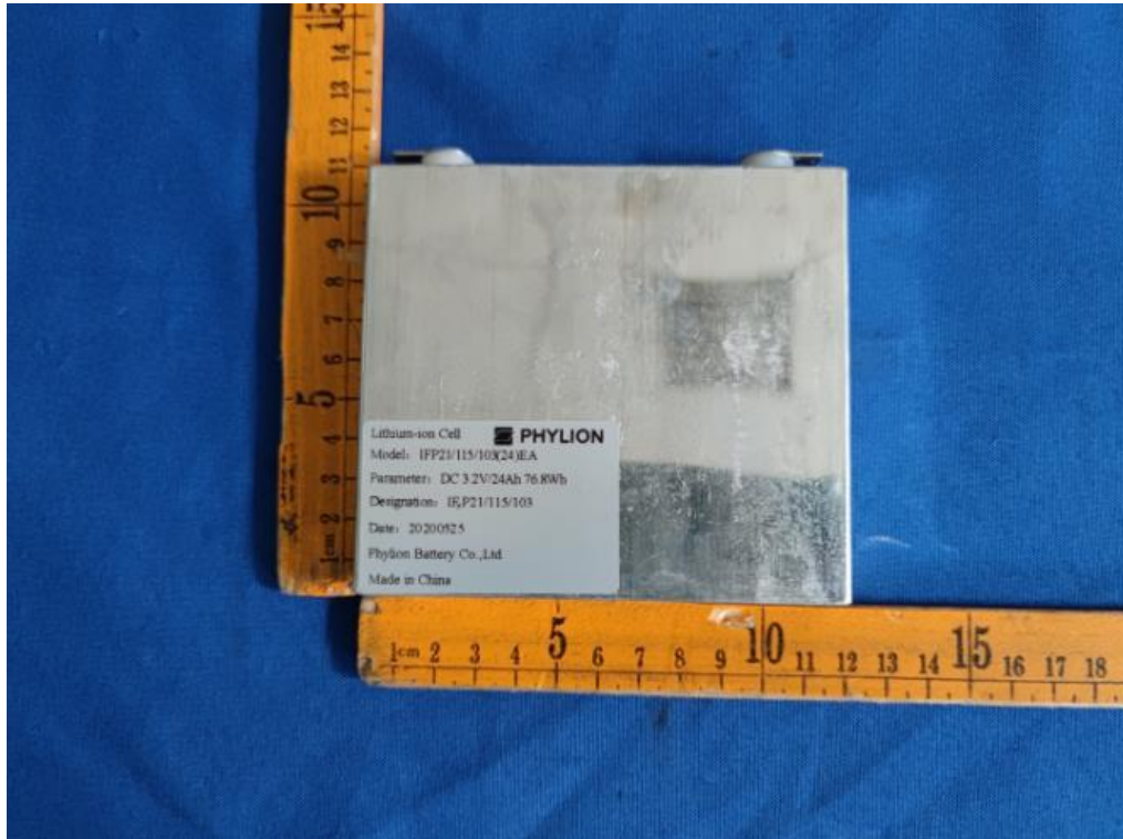
样品图片 (Sample photograph) -10