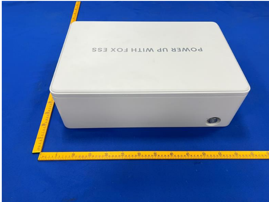
样品图片 (Sample photograph) -4