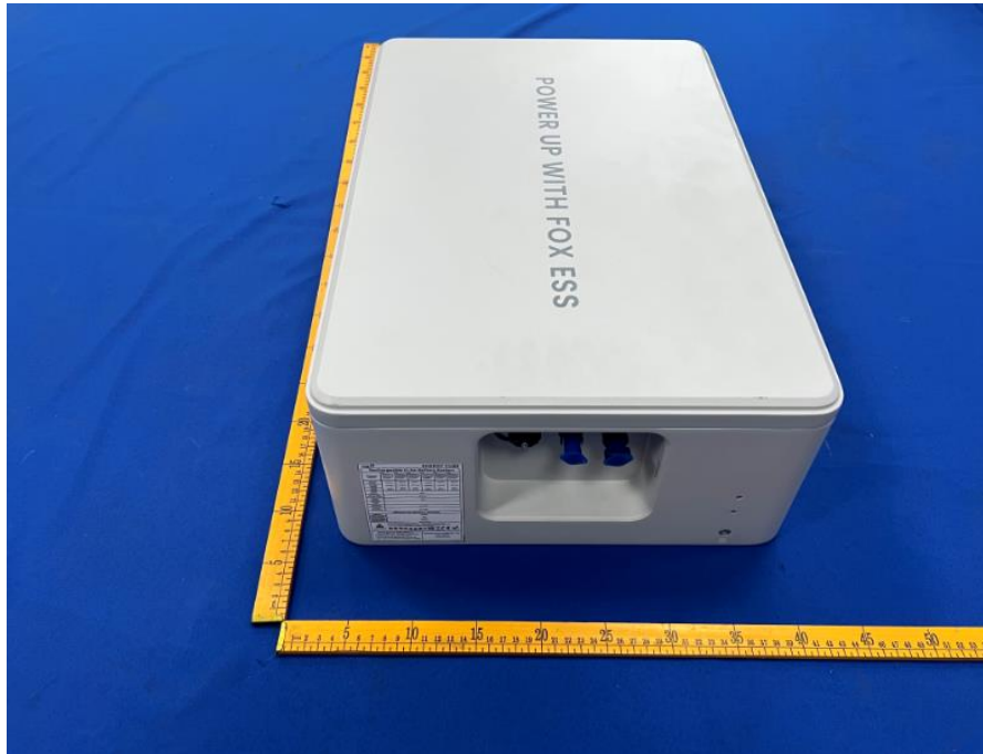
样品图片 (Sample photograph) -6